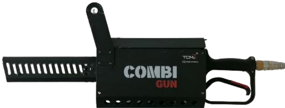
TCM500 – Combi-Gun